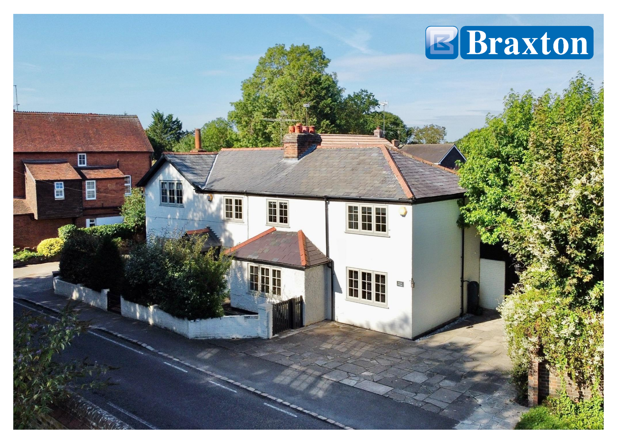
Garth Cottage, Ascot Road, Holyport, Berkshire SL6 2HY