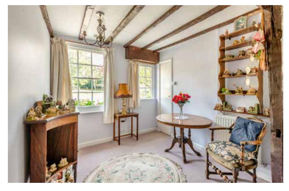
An Warm Welcome