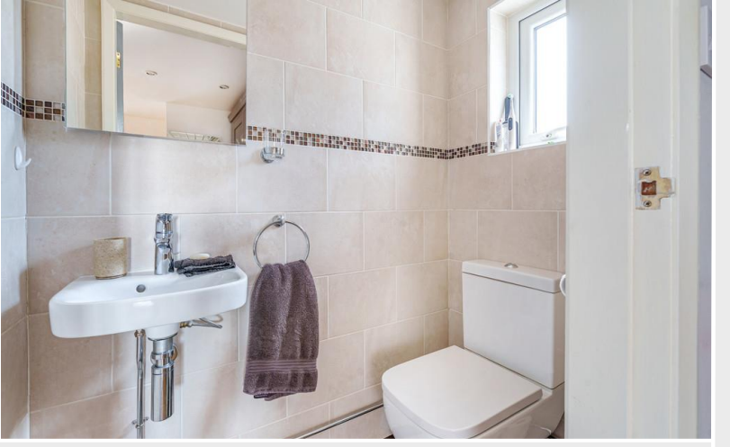
Bedroom 1 En-Suite WC