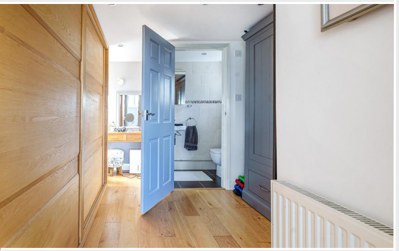
Dressing Room to En-Suite