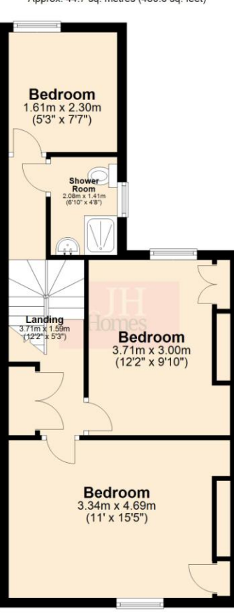
Total area: approx. 89.0 sq. metres (958.3 sq. feet)