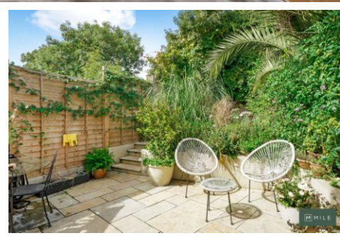
Tubbs Road, London NW10 £470,000 Leasehold