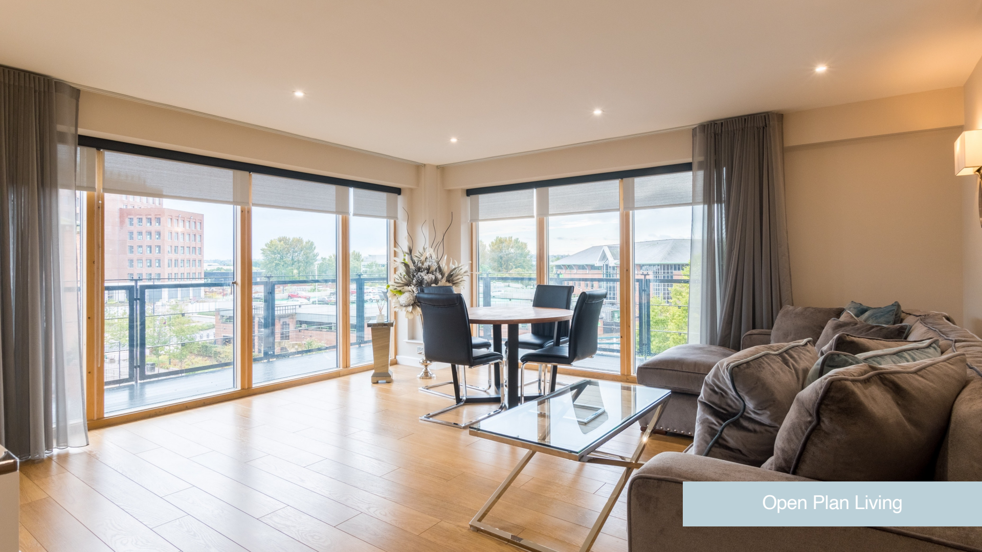
Open Plan Living