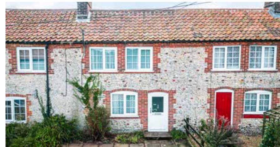
2 The Cottages

“It’s peaceful and cosy here - a lovely place to relax.”