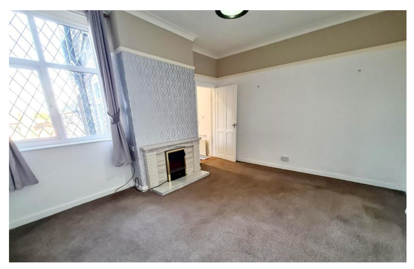
Leek New Road, Stoke-on-Trent