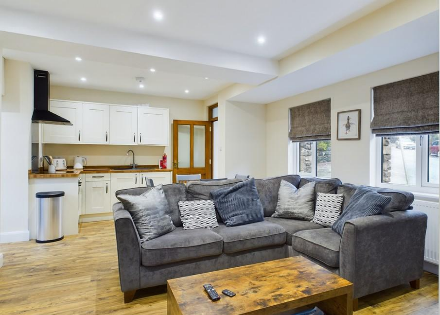
Kitchen Living Room