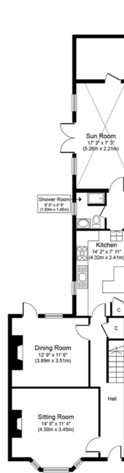
Ground Floor Approximate Floor Area 828 sq. ft. (77.0 sq. m.)