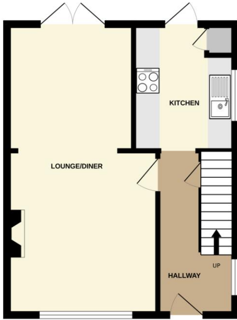
GROUND FLOOR 389 sq.ft. (36.2 sq.m.) approx.