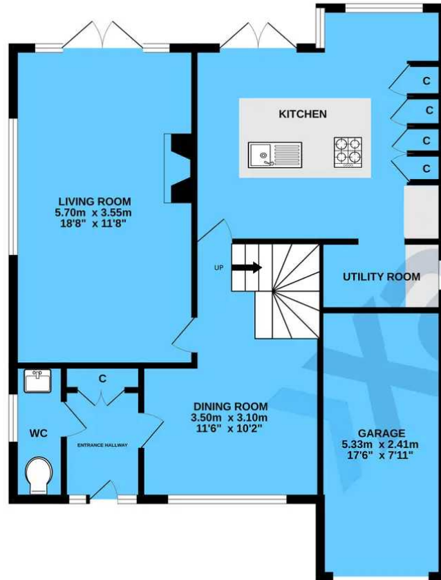
GROUND FLOOR 78.8 sq.m. (848 sq.ft.) approx.