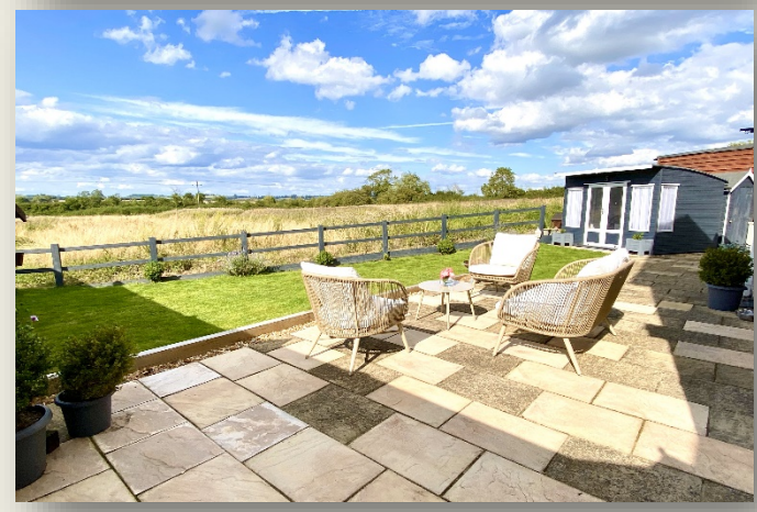
Viewing is Strictly by Appointment through Reaston Brown