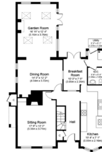
Ground Floor Approximate Floor Area 1,006 sq. ft. (93.5 sq. m.)