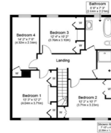
First Floor Approximate Floor Area 767 sq. ft. (71.2 sq. m.)