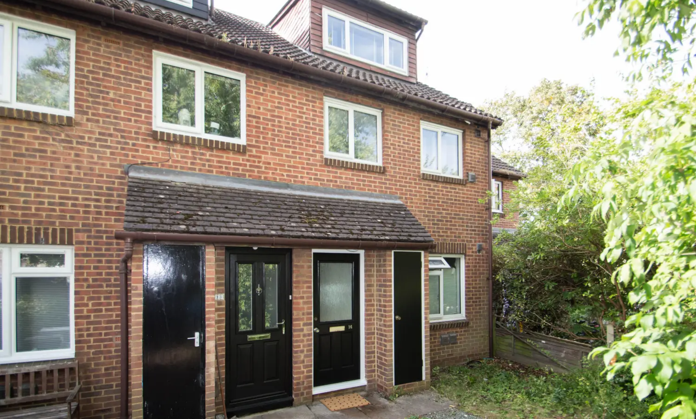
14 Saxon Close, Surbiton £1,700 pcm