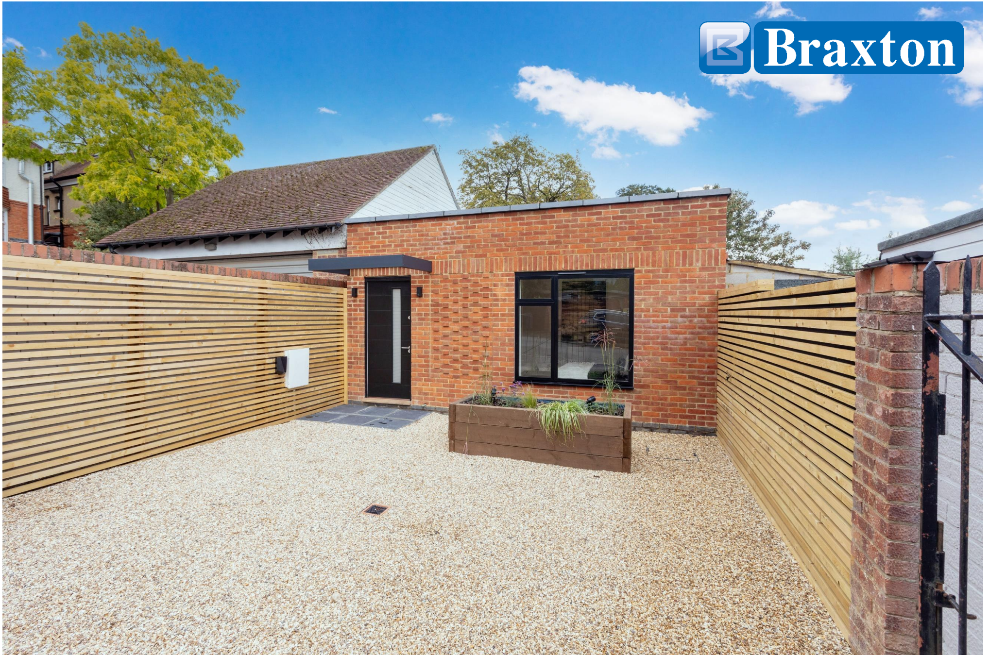
The Old Workshop, Lower Boyndon Road, Maidenhead, Berkshire, SL6 4DD