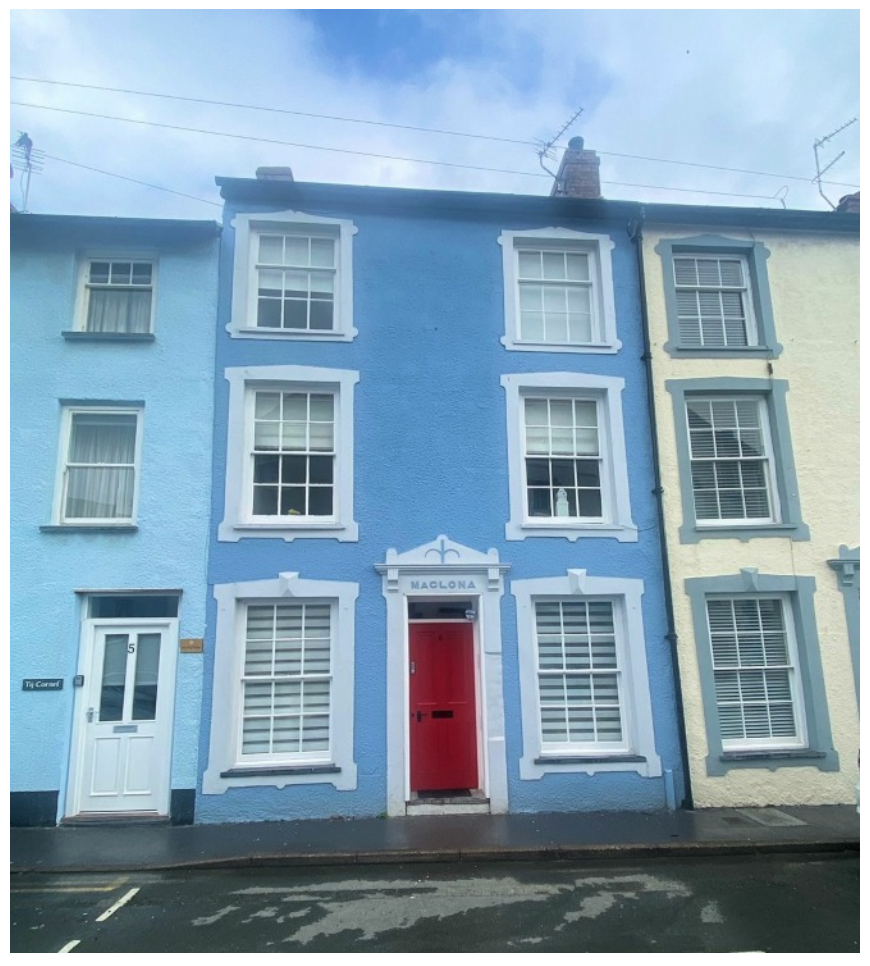
2-3 bedroom Grade 2 listed townhouse Immaculately presented Central village location Gas centrally heated with new gas fire and boiler.