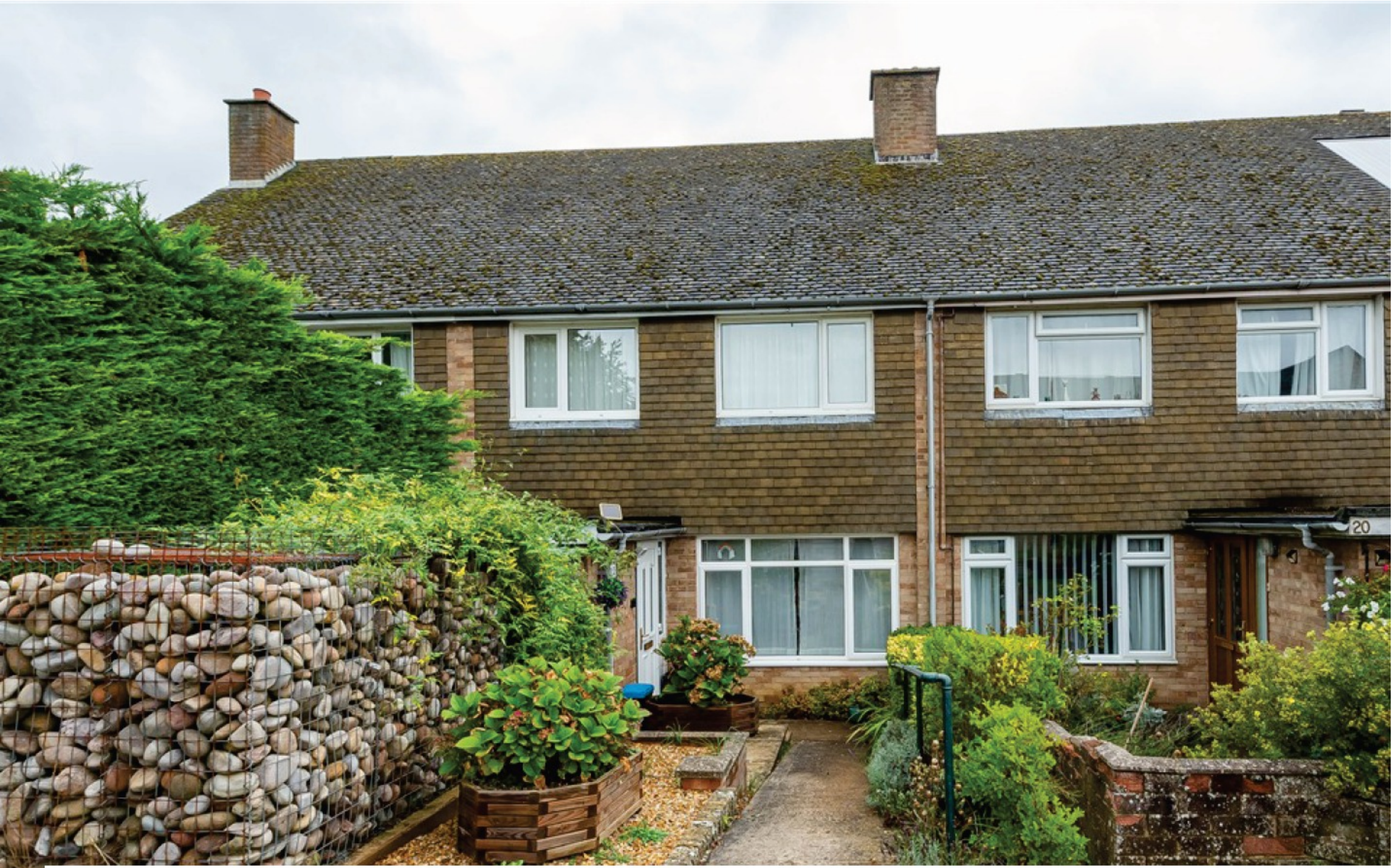
Windrush Way, Standlake