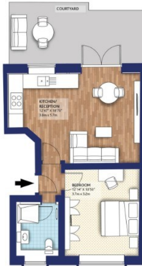
29 Cheval Place Deluxe One Bedroom Apartment: 423.56 sq. ft. | 39.35 m 2

Please note all floor plan measurements and furniture placements are approximate and may not be to scale.