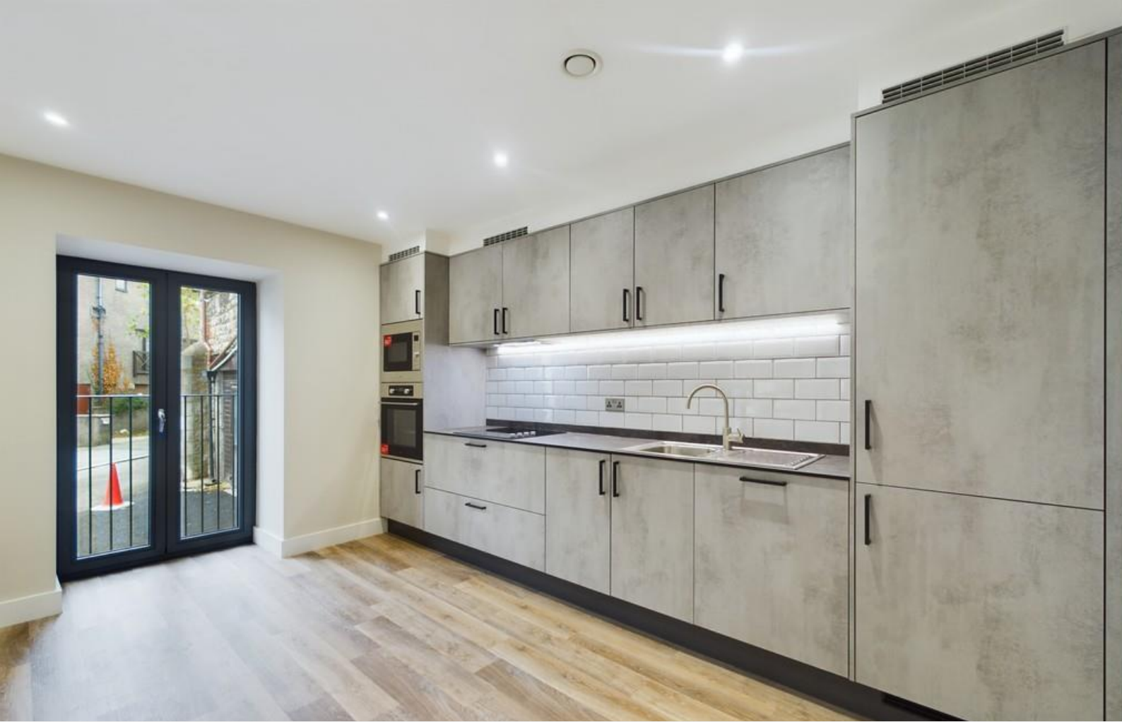
Open Plan Kitchen