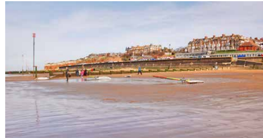
Hunstanton beach and seafront

“19 Evans Gardens is perfectly placed to enjoy all that Hunstanton has to offer...”