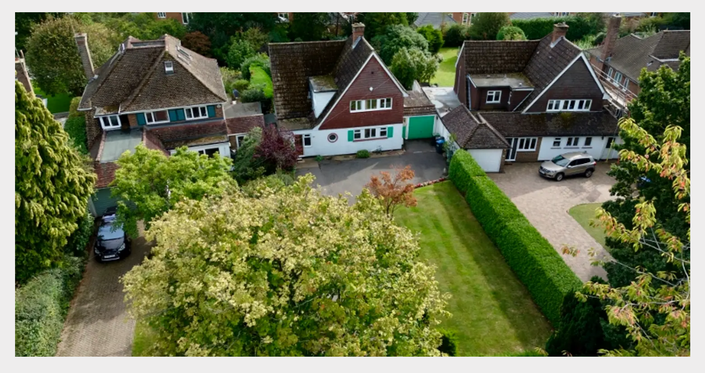
28 Fox Hill Village, Haywards Heath, West Sussex RH16 4QZ

GUIDE PRICE ... £800,000-£850,000 ... FREEHOLD