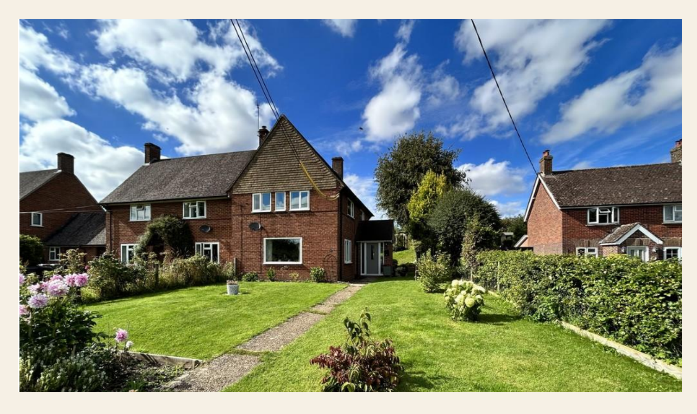
3 Bedroom Semi-Detached House Kennet Rise, Axford