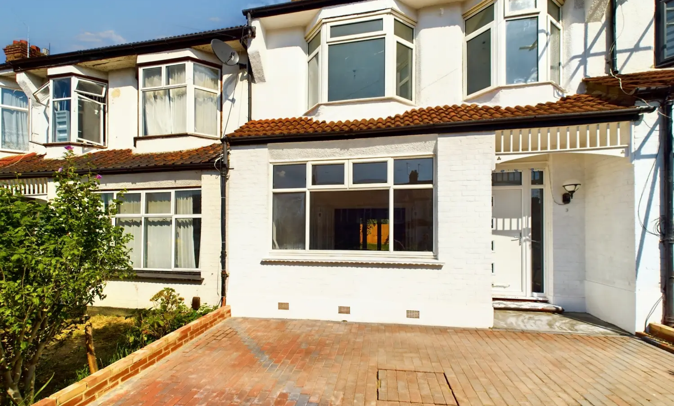
Bexhill Road, London