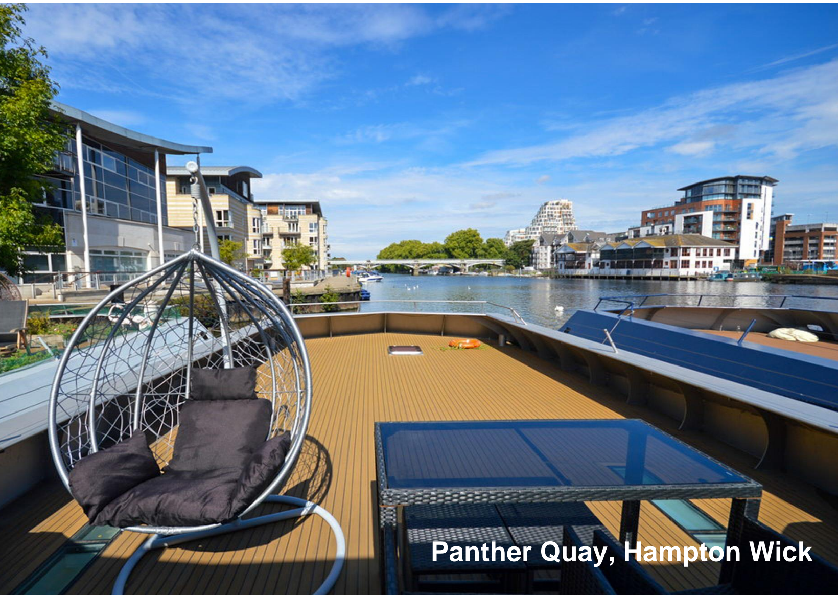
Panther Quay, Hampton Wick