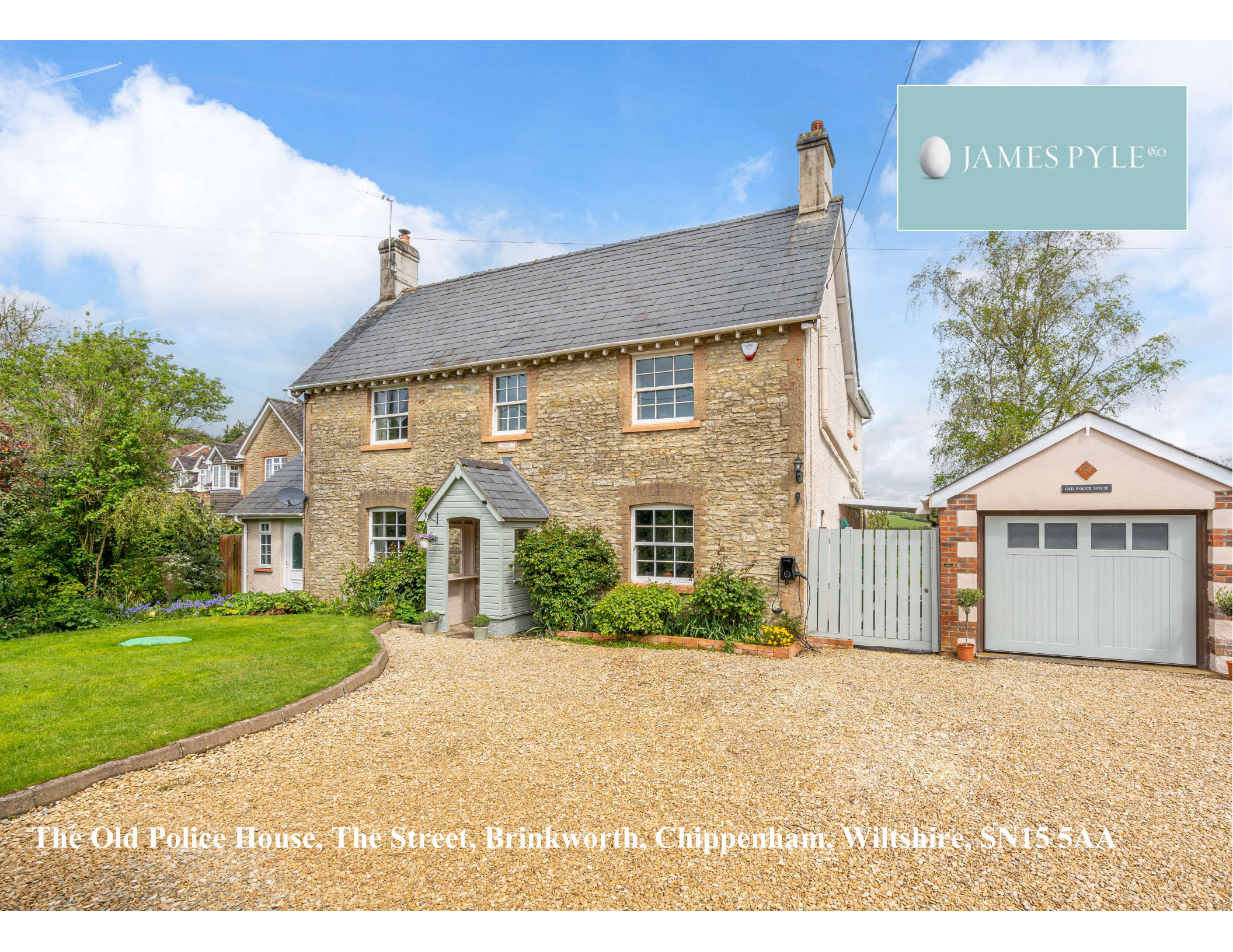
The Old Police House, The Street, Brinkworth, Chippenham, Wiltshire, SN15 5AA