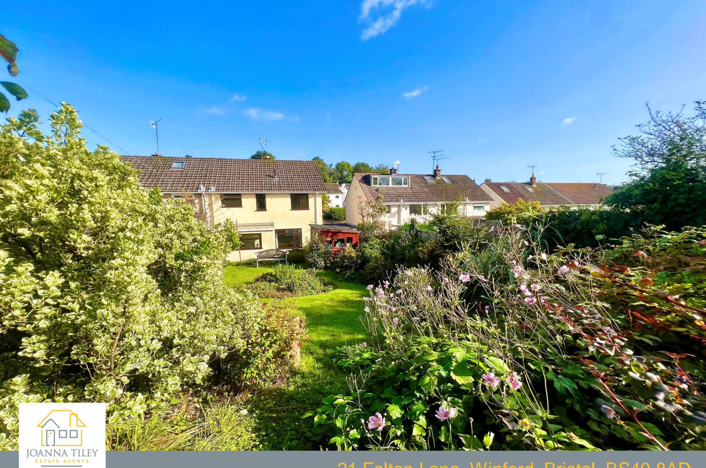
21 Felton Lane, Winford, Bristol, BS40 8AD