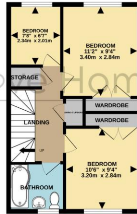
1ST FLOOR 414 sq.ft. (38.5 sq.m.) approx.

TOTAL FLOOR AREA : 1232 sq.ft. (114.5 sq.m.) approx. Drawn by Love Homes for illustrative purposes only. Measurements and areas shown are approximate. Made with Metropix ©2023