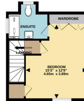
2ND FLOOR 291 sq.ft. (27.0 sq.m.) approx.