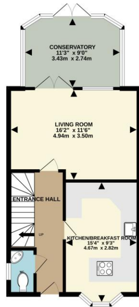
GROUND FLOOR 527 sq.ft. (48.9 sq.m.) approx.

TOTAL FLOOR AREA : 1232 sq.ft. (114.5 sq.m.) approx. Drawn by Love Homes for illustrative purposes only. Measurements and areas shown are approximate. Made with Metropix ©2023