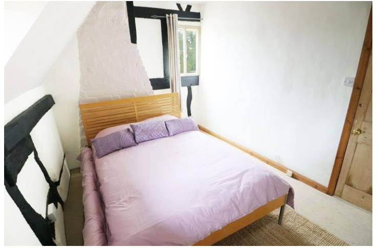
Bedroom Two 8'6" x 6'7" (2.58 x 2.00)