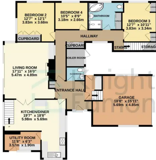
GROUND FLOOR 1711 sq.ft. (159.0 sq.m.) approx.