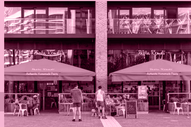
PASTA REMOLI Authentic Handmade Pasta 5 min walk