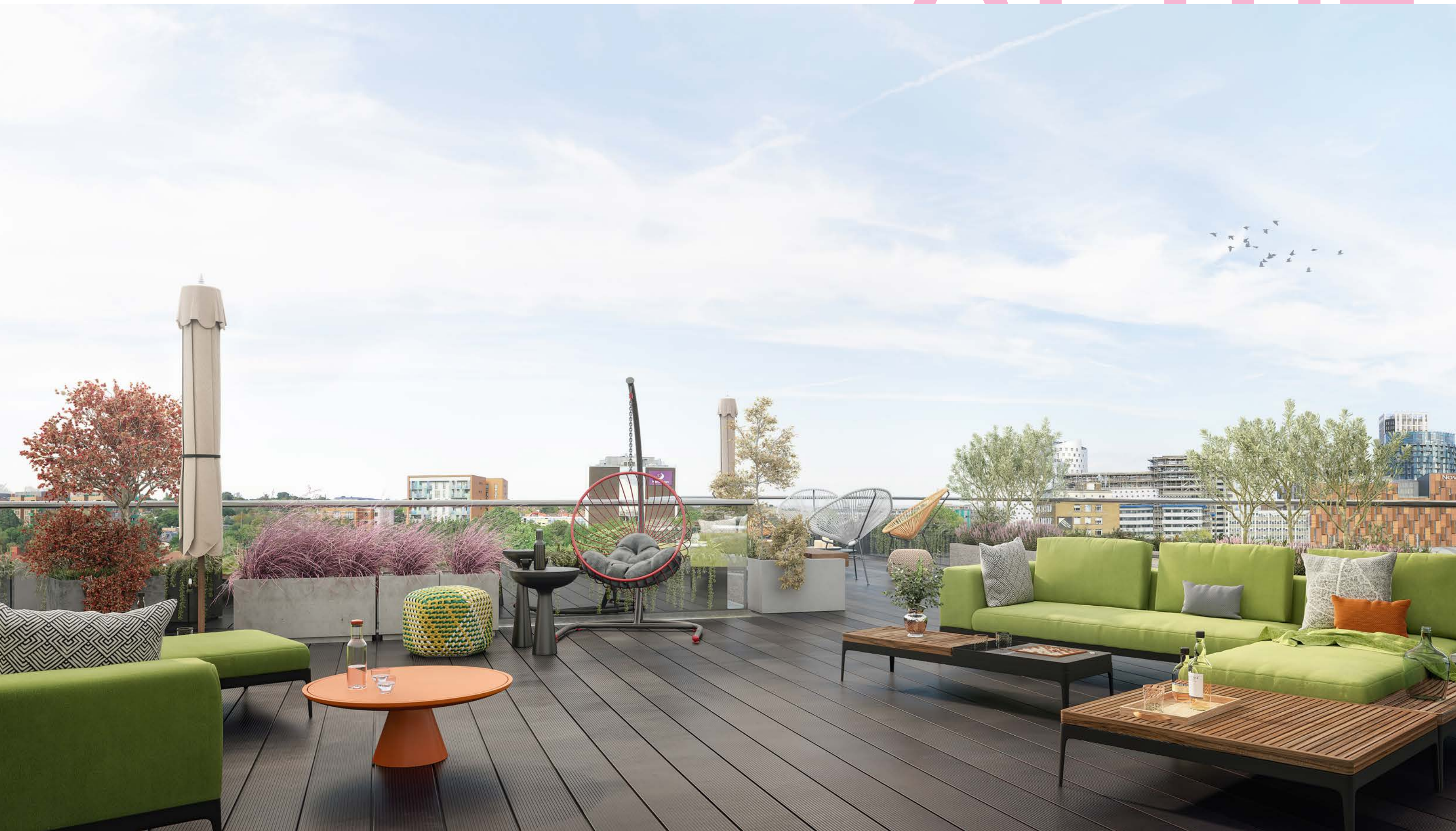
At the top of Empire One sits the communal roof terrace, offering perspectives of London's classic skyline. Shielded by a glazed balustrade that extends around the rooftop's perimeter, the terrace is a welcoming and relaxing environment, perfect for enjoying long summer evenings with friends or a morning meditation.

AT THE T N M R J V S K SHIELDED GLAZED B