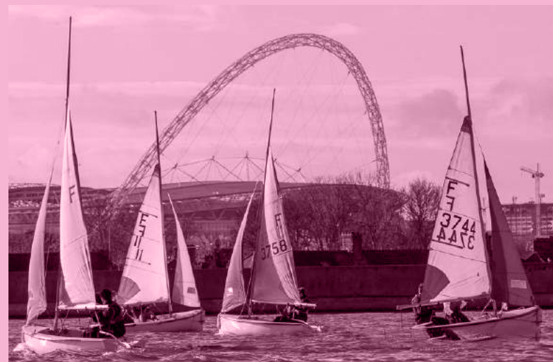
WELSH HARP Learn to sail, wind surf or canoe with one of the many clubs on the Harp 28 min walk