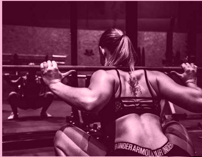
THE GYM Fully equipped, low-cost gym 7 min walk