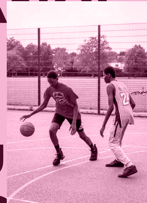
KING EDWARD VII PARK 13 min walk