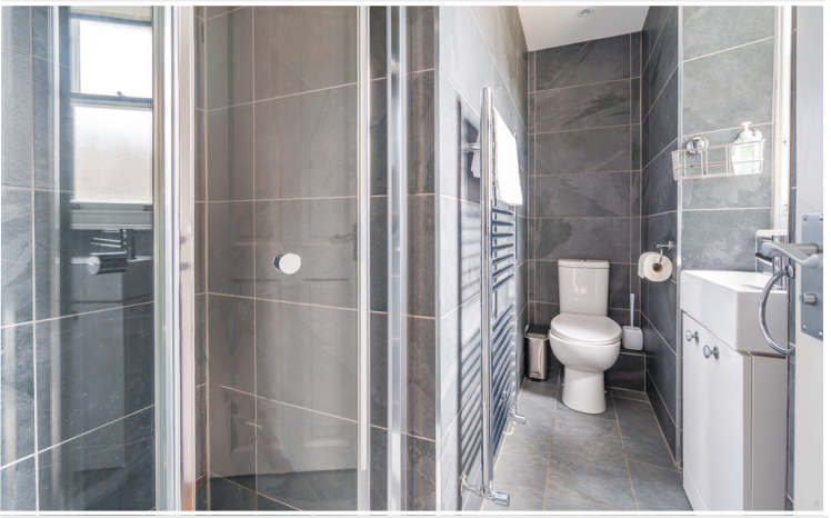
Bedroom 1 En-Suite Shower Room