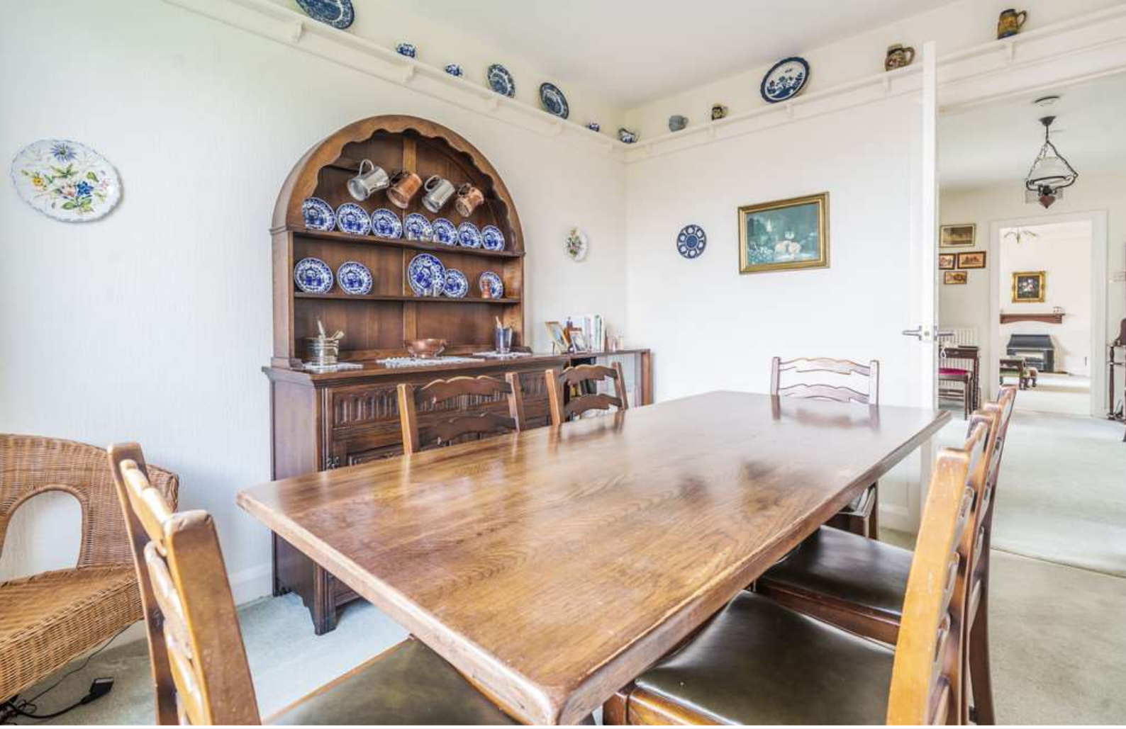
Bedroom Three/Dining Room