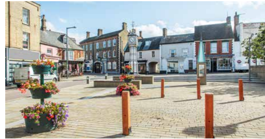
Downham Market Town Centre

“It’s a really convenient location - within a short walk of both the train station and the town centre.”