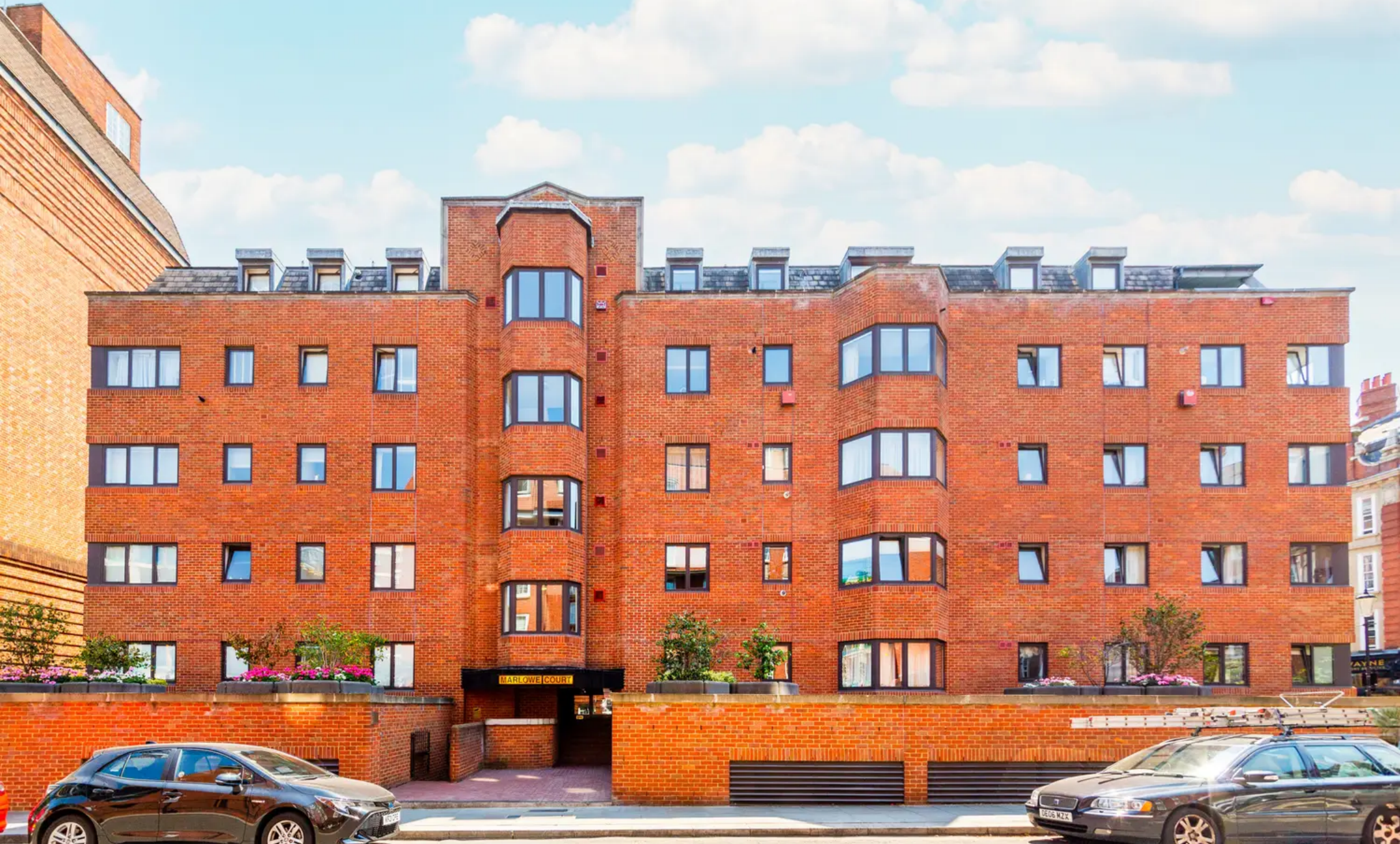
Flat 6, Marlowe Court, 2 Petyward £3,950 pcm