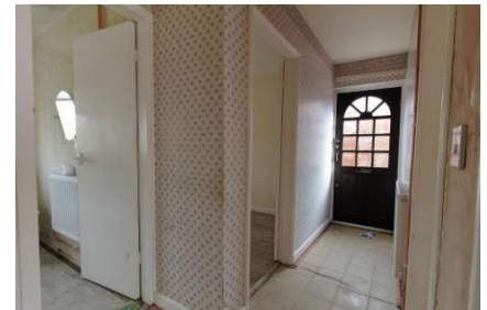
GROUND FLOOR 501 sq.ft. (46.5 sq.m.) approx.