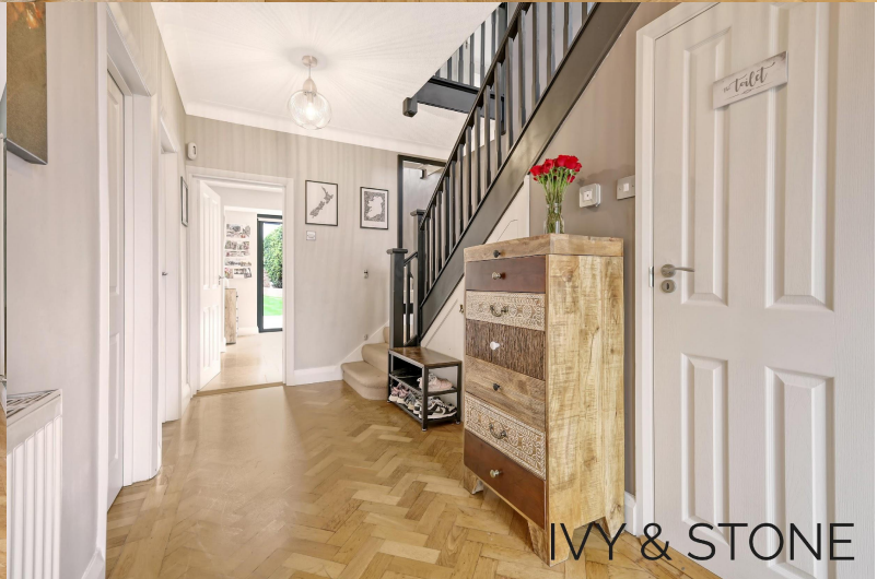
IVY & STONE