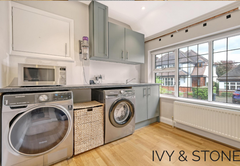
IVY & STONE