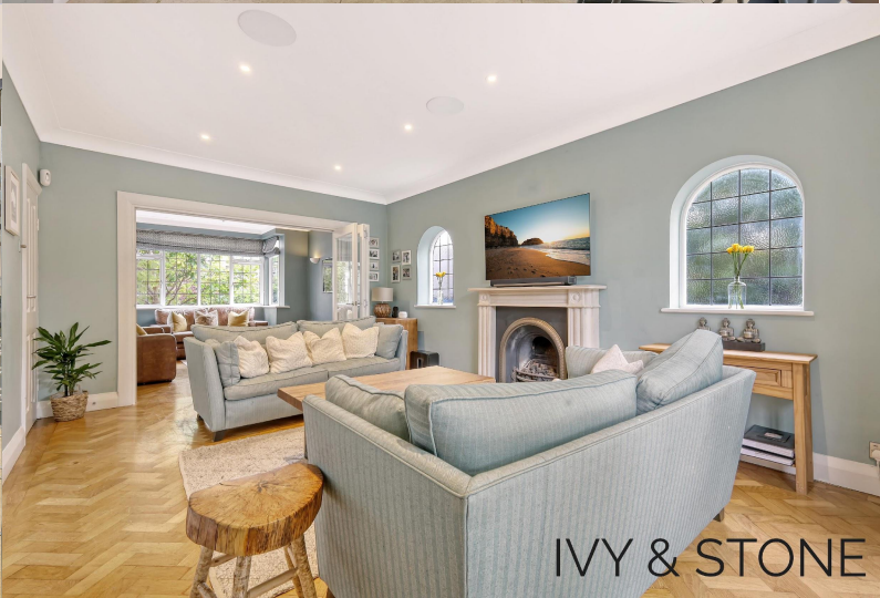
IVY & STONE