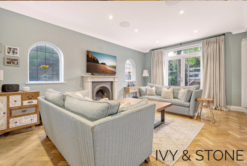
IVY & STONE