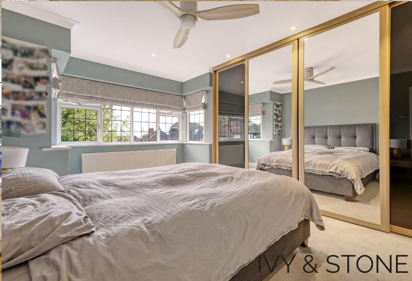
IVY & STONE