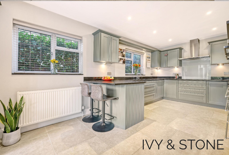
IVY & STONE