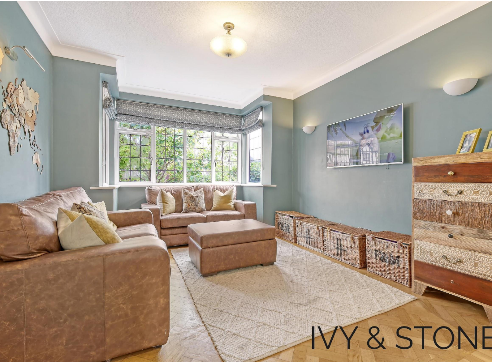
IVY & STONE