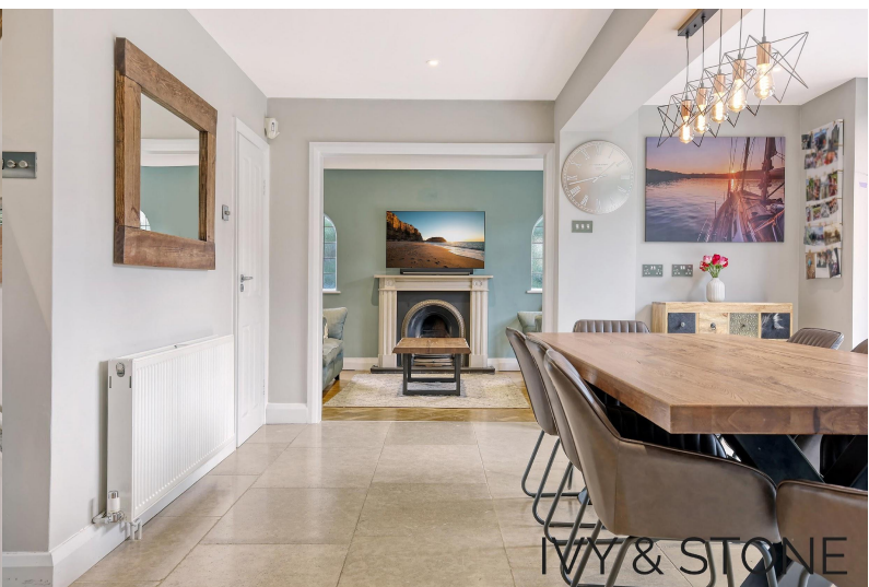
IVY & STONE