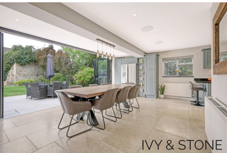
IVY & STONE