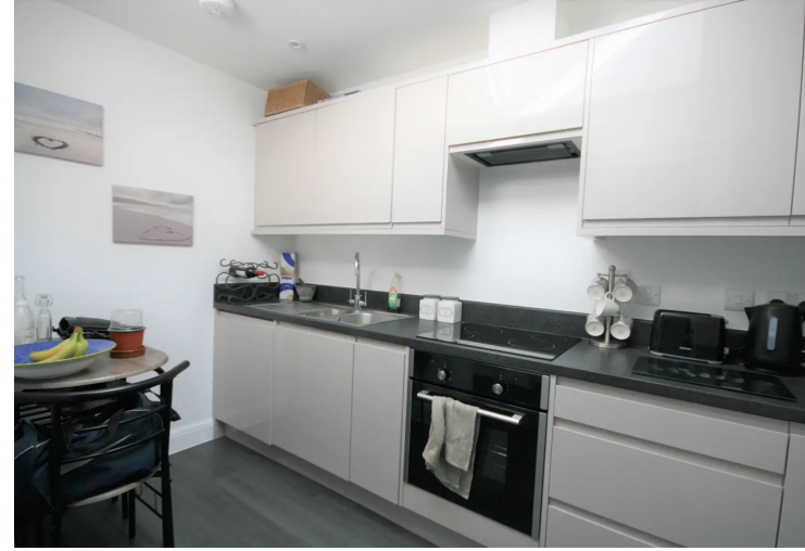
Flat 1, 177A Moulsham Street, Chelmsford