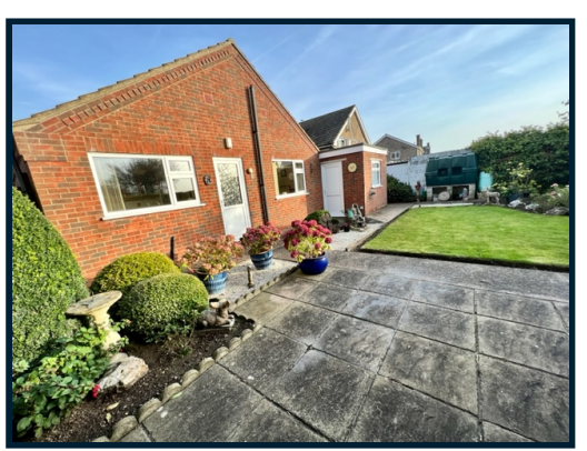
Terraine Jubilee Road North Somercotes Louth LN117LH