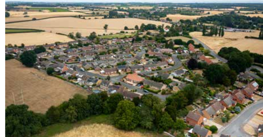
Drone Image of Saham Toney

“This home is set in the quaint village of Saham Toney, a lovely peaceful town.”