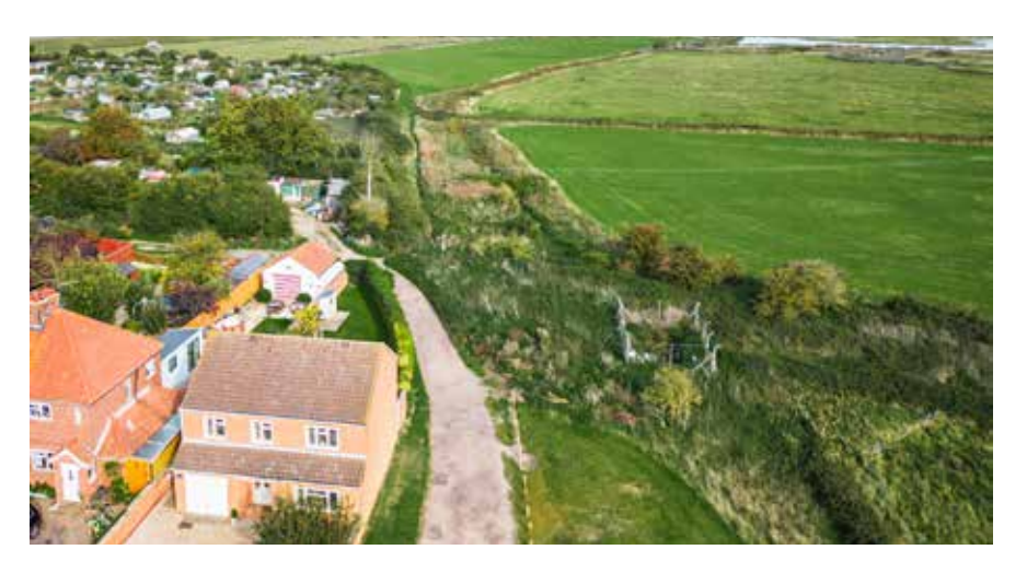
Ardmore House and the surrounding area

Alternatively treat yourself to a delicious meal at The Globe Inn or Crown Hotel overlooking the green, or push the proverbial boat out and head to Michelin-starred Morston Hall. For a simpler, yet equally quintessential Wells experience, share a box of fish and chips from French's on the harbour wall and watch the sun slowly set over the water. Imagining yourself here already? Could this be your dream coastal home?