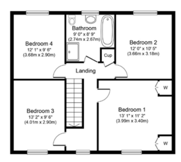
First Floor Approximate Floor Area 753 sq.ft. (69.9 sq.m.)