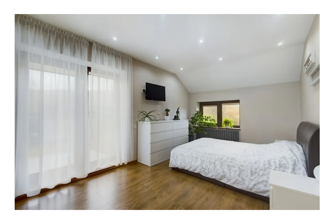
Council Tax band: D Tenure: Freehold EPC Energy Efficiency Rating: D