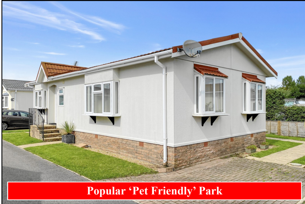
Popular 'Pet Friendly' Park

77 Selwood Park, Weymans Avenue, Kinson, Bournemouth. BH10 7JX