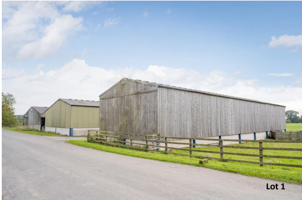
Lot 1 - West Barn Guide price - £325,000

A former agricultural building constructed of a steel portal frame, clad with Yorkshire boarding and roofed with corrugated sheeting. The planning consent provides for a 4-bedroom dwelling with parking and garden. The proposed living accommodation is to be arranged over 1 floor with an open plan kitchen, dining and living space, utility room, boot room, home office, cloak room, snug, 1 ensuite bedroom, 3 further bedrooms and a house bathroom. The accommodation extends to 2,023 sq ft (189 m 2 ). To the south elevation, the property has superb open countryside views.