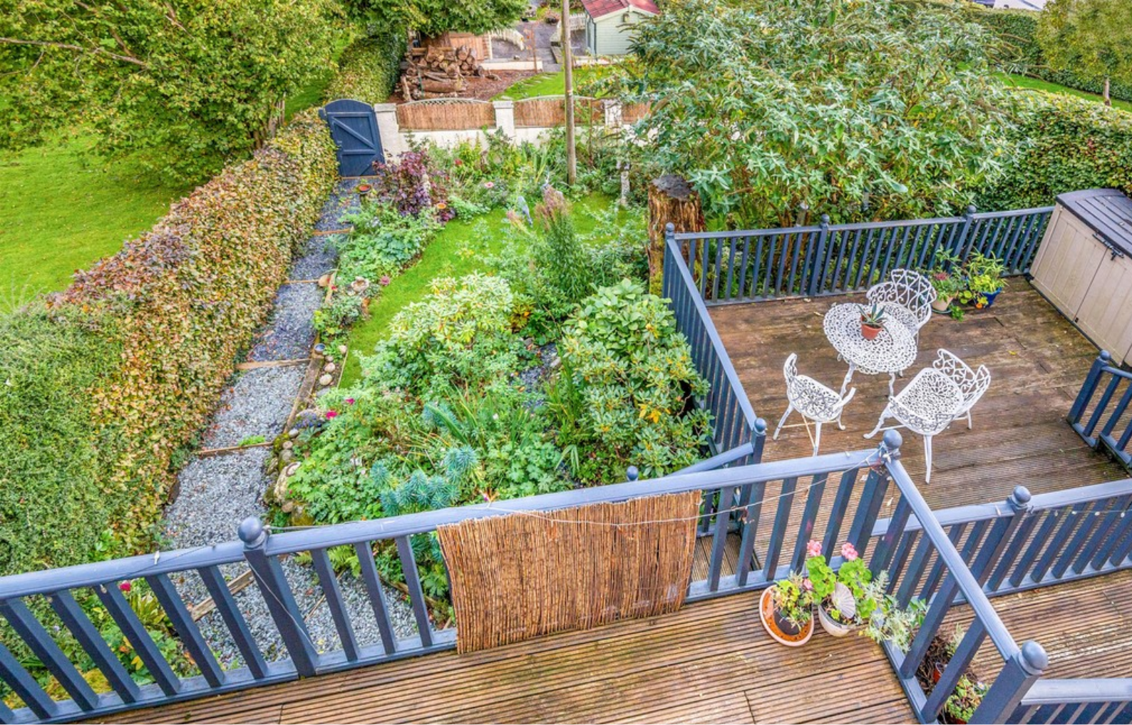
Decked Balcony and Terrace