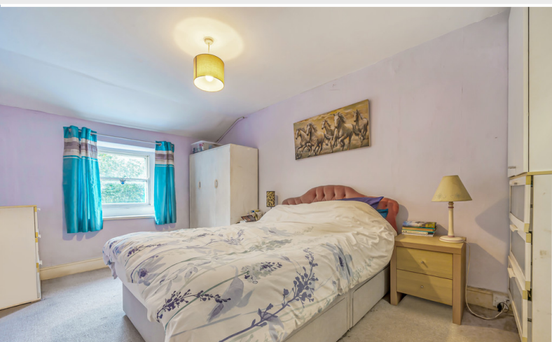
Mill House Bedroom Three