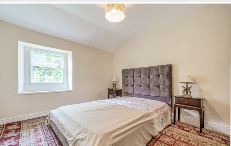
Mill House Bedroom Four

A rare opportunity to purchase a characterful traditional Grade 11 listed working flour mill originally dating before 1452 together with a substantial four bedroom main house, two adjoining two bedroom apartments successfully operating as thriving holiday lettings all set within approximately 7.9 acres of land including, grazing land, mature woodland, gardens, beck with millrace and an extensive range of outbuildings. Offering a unique lifestyle opportunity this most appealing property is delightfully situated in the village of Little Salkeld nestling within Cumbria's picturesque Eden Valley approximately six miles from Penrith and under two miles from the neighbouring village of Langwathby.