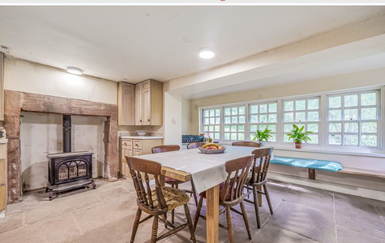
Mill House Dining Kitchen