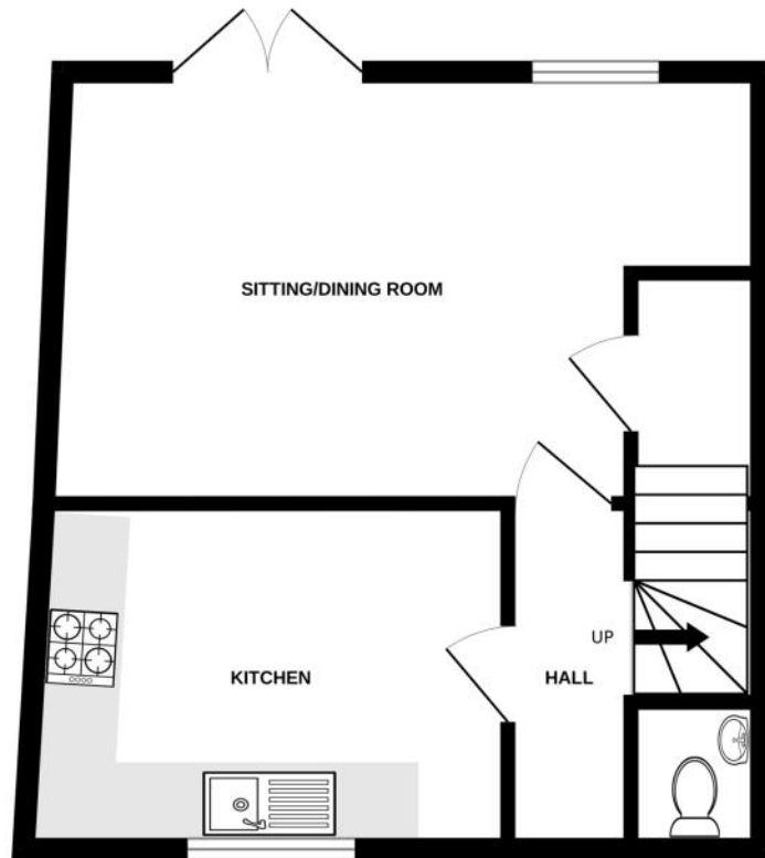
GROUND FLOOR 378 sq.ft. (35.1 sq.m.) approx.