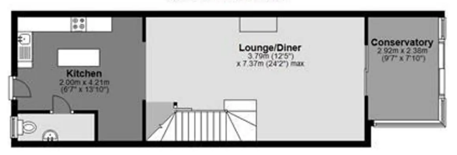
First Floor Approx 47.7 sq. metres (513.5 sq. feet)

Approx. 51.9 sq. metres (559.1 sq. feet)