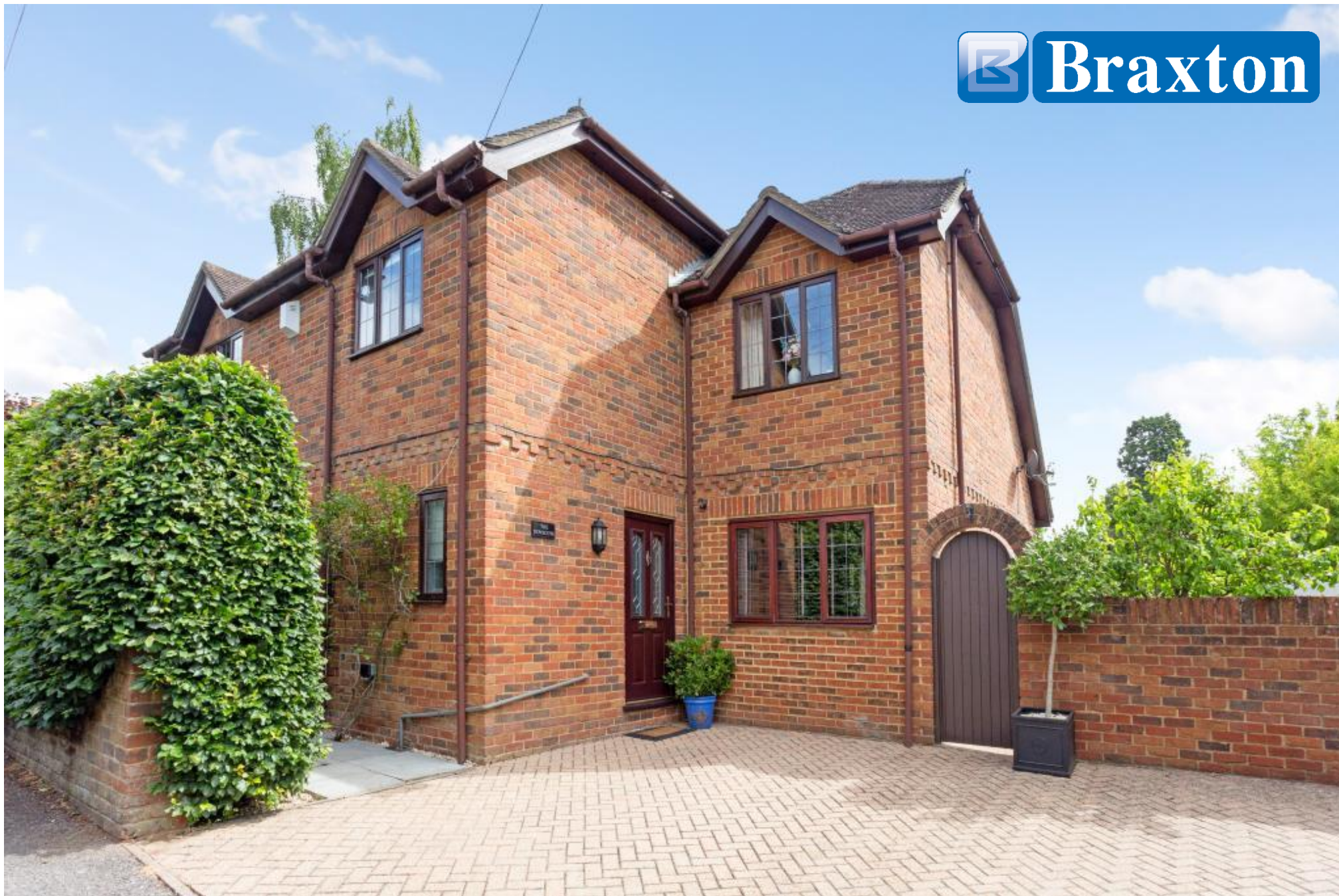
The Dovecote, Altwood Bailey, Maidenhead, Berkshire, SL6 4PQ