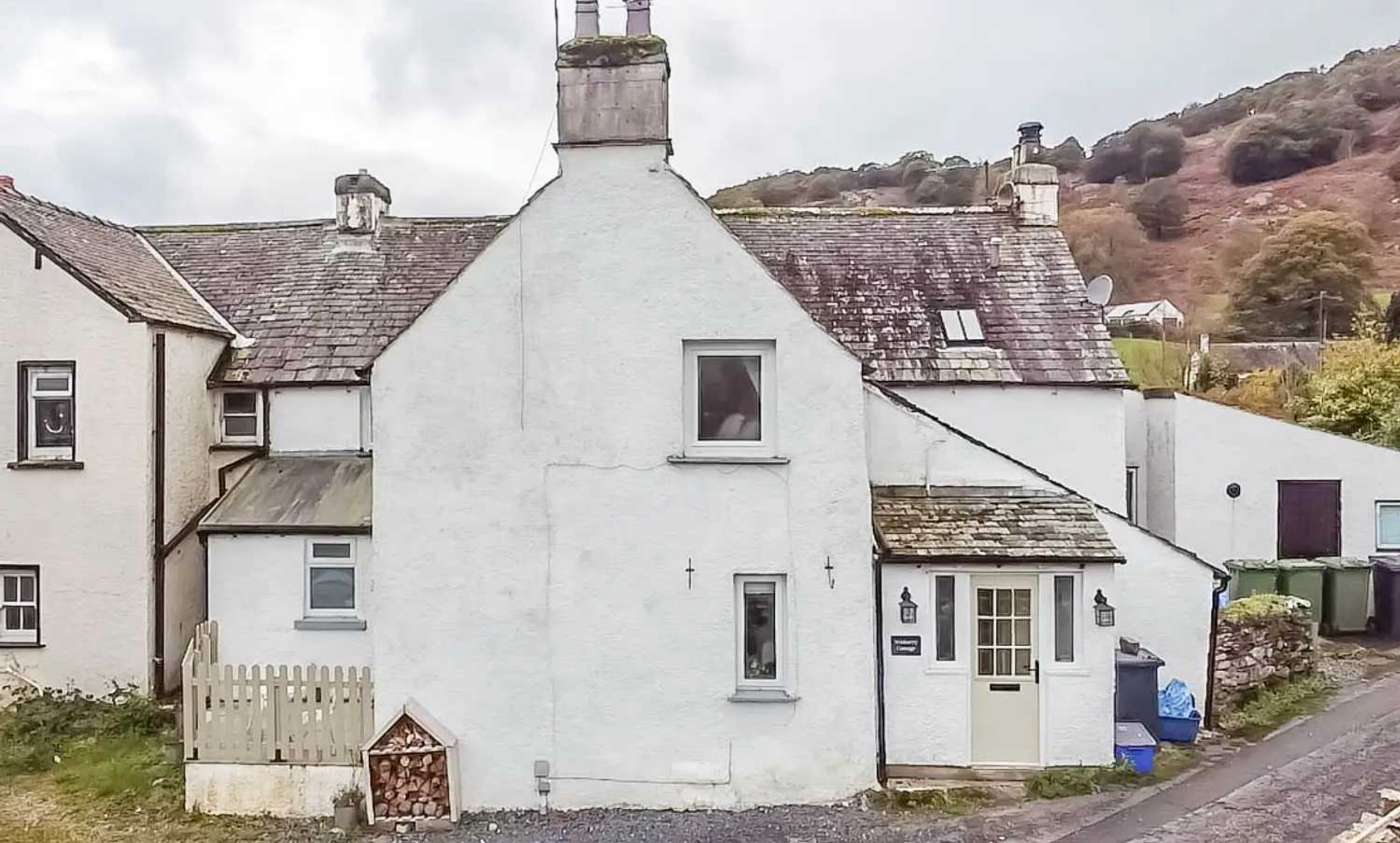
Winberry Cottage, Finsthwaite £380,000